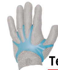
GS-100 Glove Tensioner

Today, you need the dual protection of Niroflex2000® metal mesh gloves. Niroflex2000 is the first and only ultra-hygienic mesh glove designed to protect the hands of your workers and safeguard your food from contamination. More than 12,000 tiny reinforced links and the patented Niroflex clip closure system guarantee a secure, comfortable custom fit for every worker. Niroflex2000's natural hand shape and food-safe TPU stiffener (on extended cuff styles) make it the most comfortable mesh glove available.