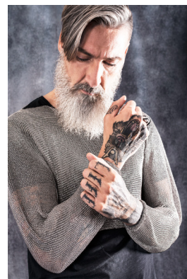
12SS | Short Vest