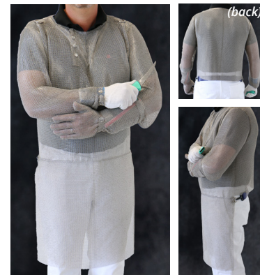
9130HBT | Half Back Tunic