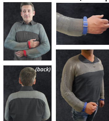
28SS-NS | Double Sleeve (No Straps)